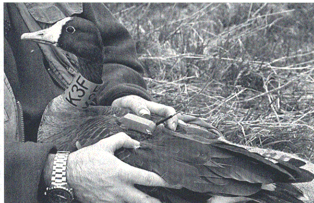
White-fronted Goose # K3F with transmitter, Wexford 22 March 1998.

Before satellite transmitters were attached to geese the effects of two different dummy transmitter weights and two different harness types were tested on wintering Greenland White-fronted Geese. The average weights of the dummy transmitters were 38.0 g (SD=2.3, n=6), and 54.1 g (SD=2.2, n=6), respectively. The average weight of the lightest dummies corresponded to that of the subsequently chosen Microwave Telemetry satellite transmitters, PTT100, 30 g version (35.6 g, SD=0.4, n=6). The dummy transmitters contained a radio transmitter